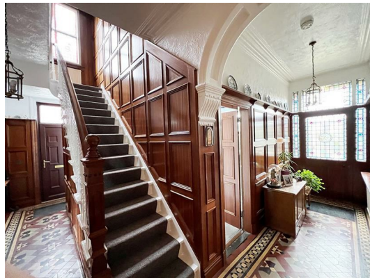
COMMUNAL LOUNGE 4.20 x 4.60 (13'9" x 15'1")