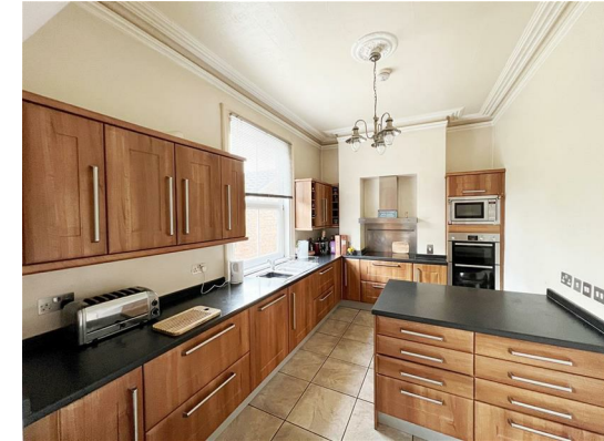
STORE ROOM 2.07 x 2.83 (6'9" x 9'3")