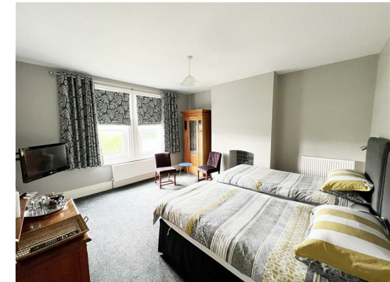
ENSUITE FOUR 3.11x 1.00 (10'2"x 3'3")