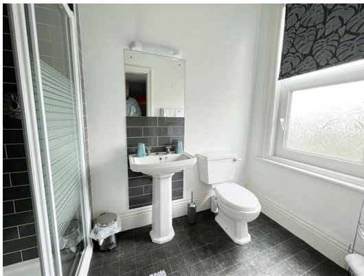
BEDROOM THREE 4.23 x 4.58 (13'10" x 15'0")