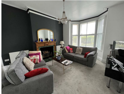
DINING ROOM 4.60 x 4.20 (15'1" x 13'9")