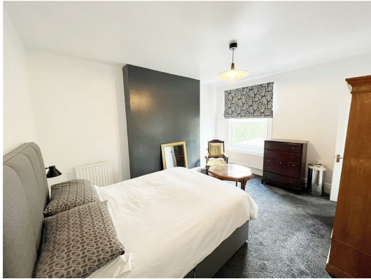
ENSUITE TWO 4.15 x 2.68 (13'7" x 8'9")