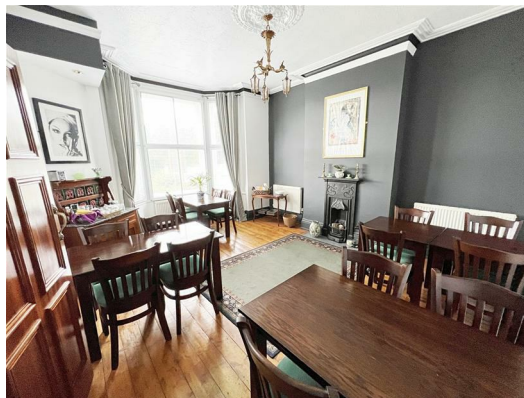
OWNERS DINING KITCHEN 2.43 x 3.81 (7'11" x 12'5")